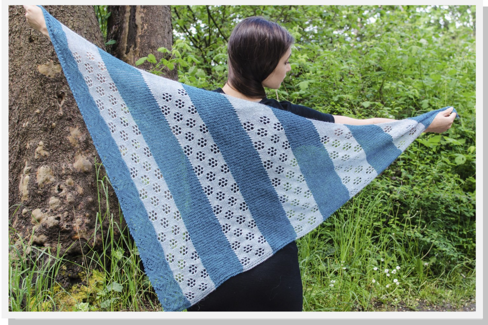
Chart – Primitive Flowers Stitch Pattern

Wet block the piece, stretching it into an asymmetrical triangular shape to meet the specified measurements and to open up the lace pattern.